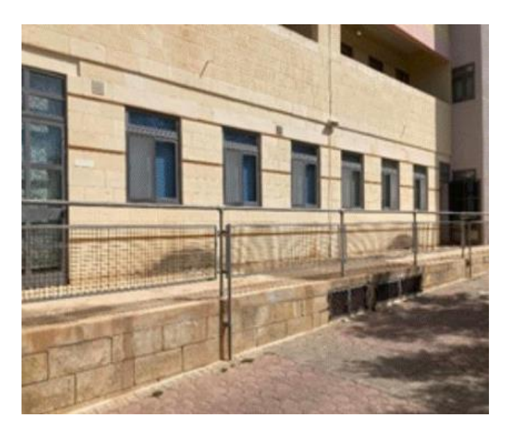
The place where the new bicycle racks will be installed