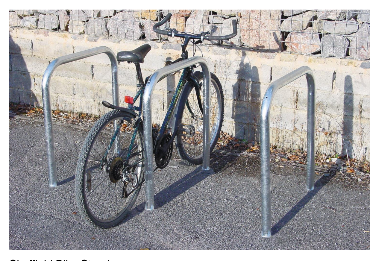
Sheffield Bike Stands

When the Ekoskola Team heard about this setback, they immediately took action to find an ideal space to install more bike racks while keeping the bicycles sheltered [racks of the Sheffield type, since the present racks are considered by many as wheel benders.]