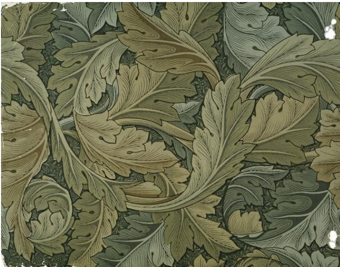
Fig 2: William Morris – Acanthus Wallpaper