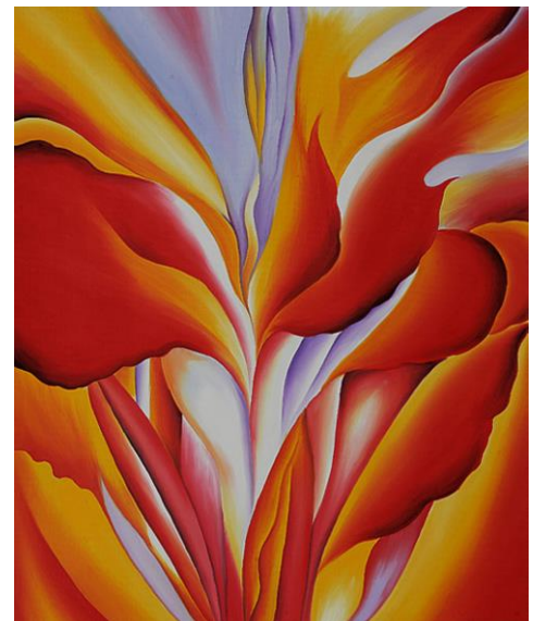
Fig.3: Georgia O’Keeffe – Red Cannas